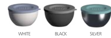
WHITE BLACK SILVER